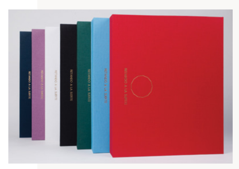
Proyecto Retando a la suerte. Fotografía de colectivo nophoto. Cortesía de nophoto.

Segunda Caja Proyecto Retando a la suerte. Fotografía de colectivo nophoto. Cortesía de nophoto.