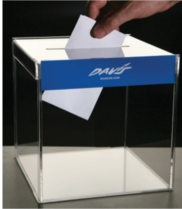
Davis Museum.

between November 16 2010 and March 27 2011 in the Reina Sofía Museum. An exhibition curated by Georges Didi-Huberman that materialised as a proposal of showing how, through the atlas, Warburg modified how the relations among the works themselves were conceived. According to Sandra Santana, Warburg's Bilderatlas becomes a metaphor of the museum understood as a manner that relates images dissolving borders "between individuals, periods of history and geography" »6. The exhibition is materialised through the works of different artists that have a common concept based on knowledge which is transversal and not standardised in the world.