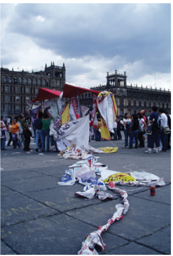
Centro Portátil de Arte Contemporáneo-CPAC.