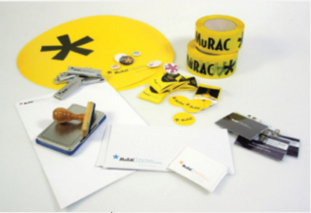
Musée du point de vue.